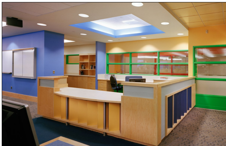
Lamin-Art's Pearlescence 2409 Brilliant Gold